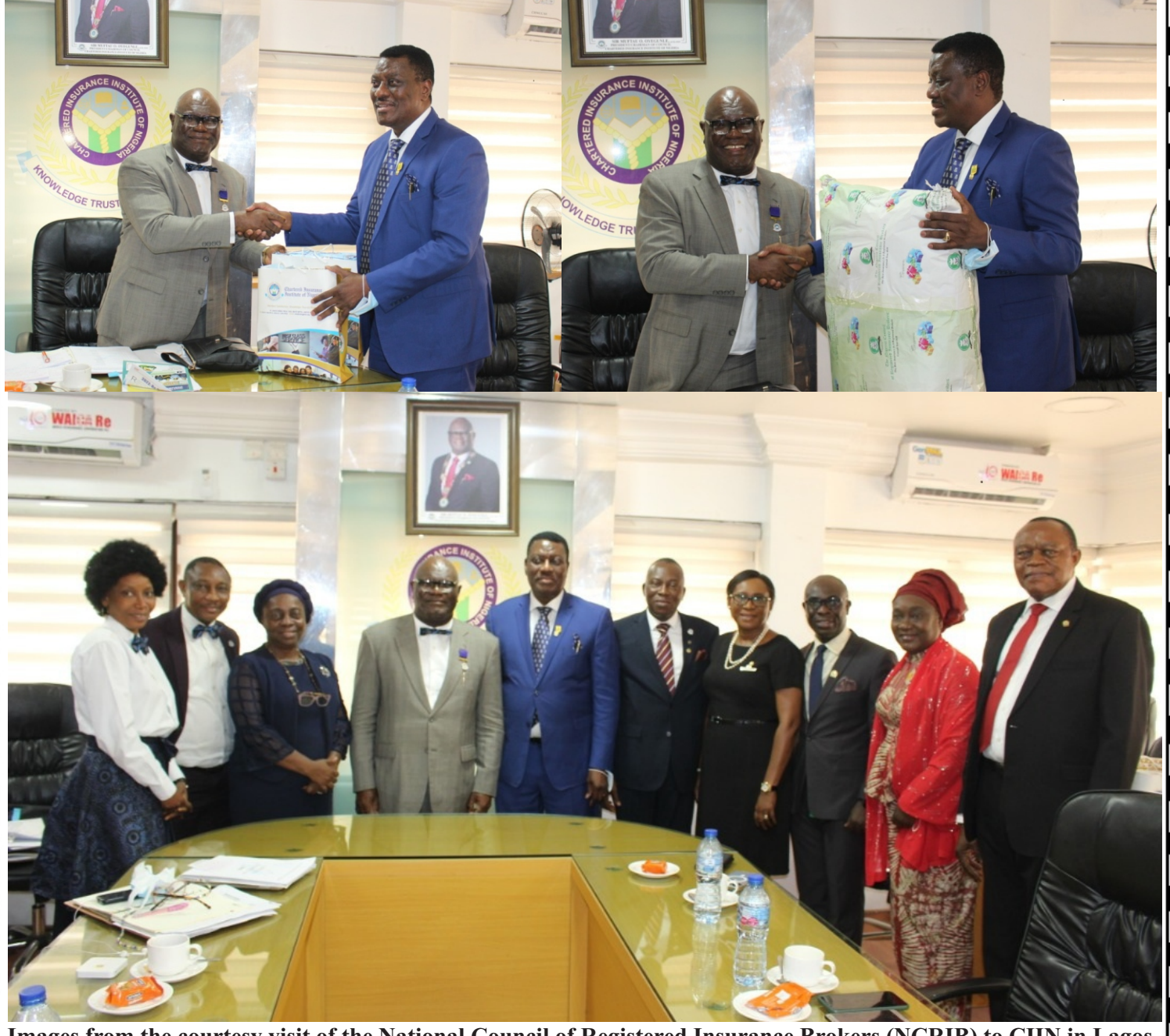
Images from the courtesy visit of the National Council of Registered Insurance Brokers (NCRIB) to CIIN in Lagos.