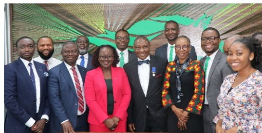
Cross section of Chartered Insurance Institute of Nigeria management visit to Enterprise Life Assurance in Lagos.

He noted that with the introduction of Islamic insurance (Takaful) and Microtakaful for small businesses, Katsina state will not be let down by the insurance industry, stressing that both indeed, both parties need each other to grow.