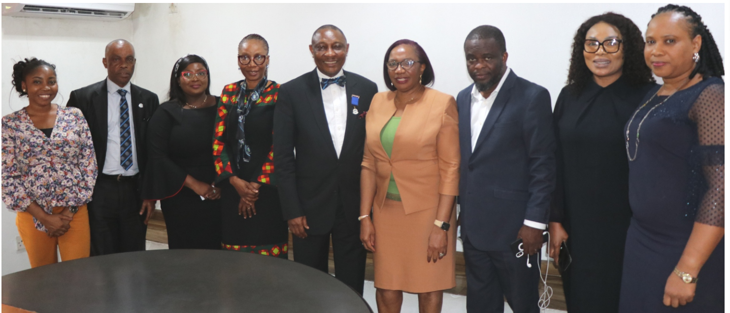
Cross section of Chartered Insurance Institute of Nigeria management with team of Great Nigeria Insurance in Lagos.