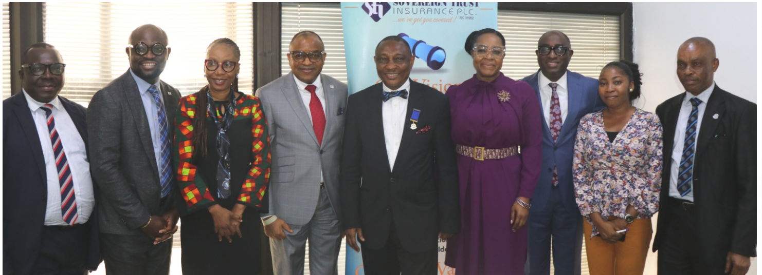
Cross section of Chartered Insurance Institute of Nigeria management with team of Sovereign Trust Insurance in Lagos.