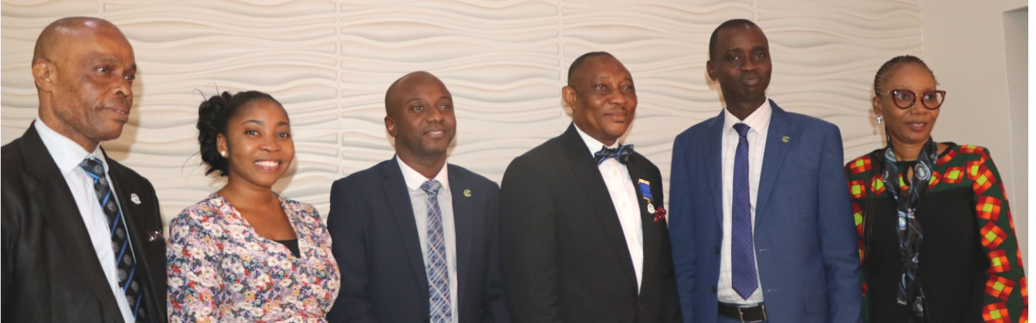
Cross section of Chartered Insurance Institute of Nigeria management with team of Cornerstone Insurance in Lagos.