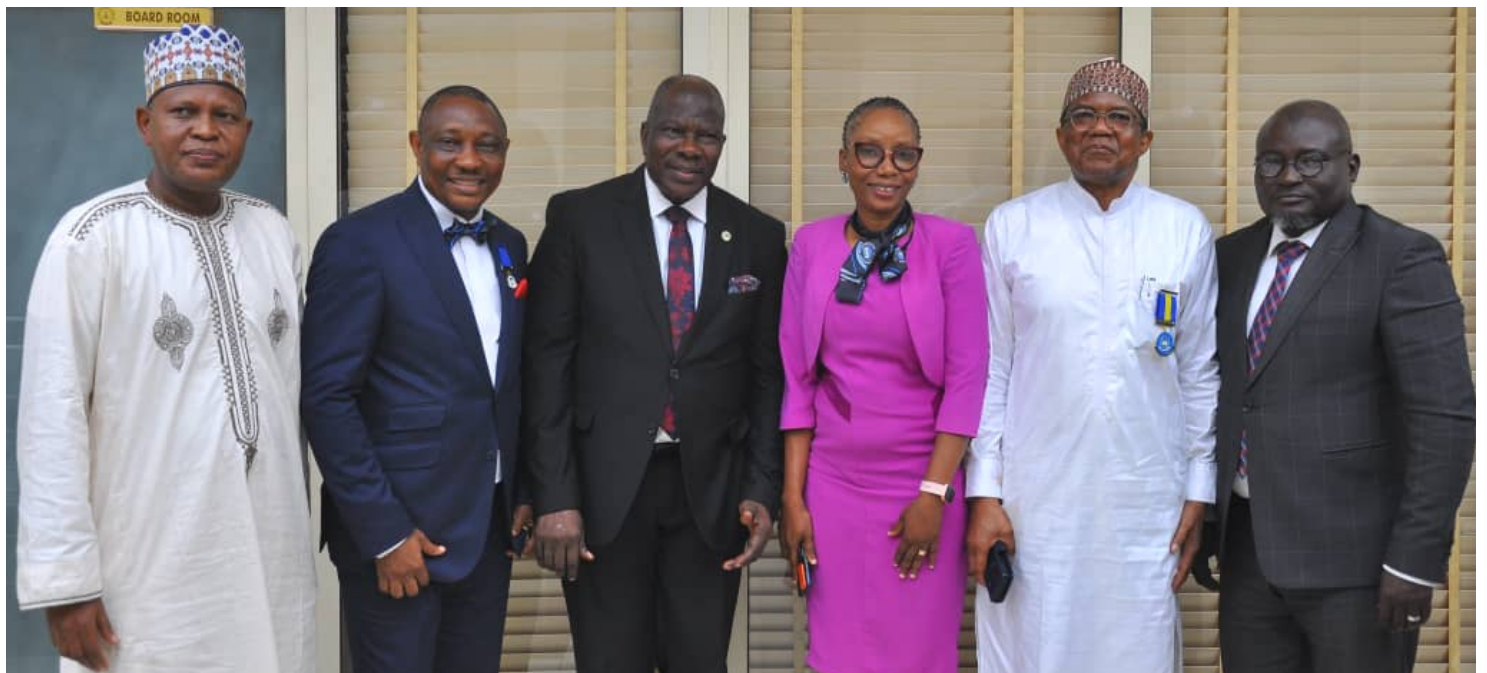
Cross section of Chartered Insurance Institute of Nigeria management visit to National Insurance Commission in Abuja.