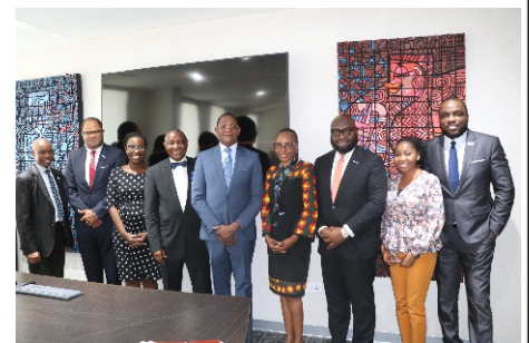
Cross section of Chartered Insurance Institute of Nigeria management visit to Continental Reinsurance.

At the visit, the companies pledged their supports to the Institute to enable it sustain the desire of raising Professionals that would take the industry to lofty heights.