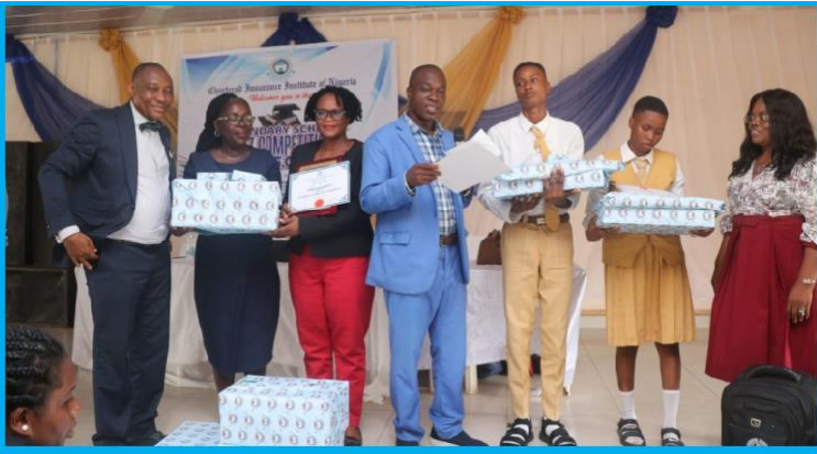
Presentation of prizes to the Second position, Niger College, Benin.