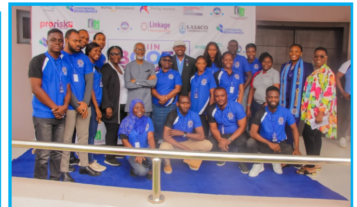
Members of Team Autocrat at the CIIN Bootcamp 4.0