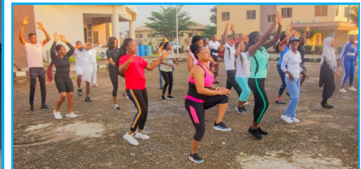
Cross Section of Participants exercising at the Camp Ground.