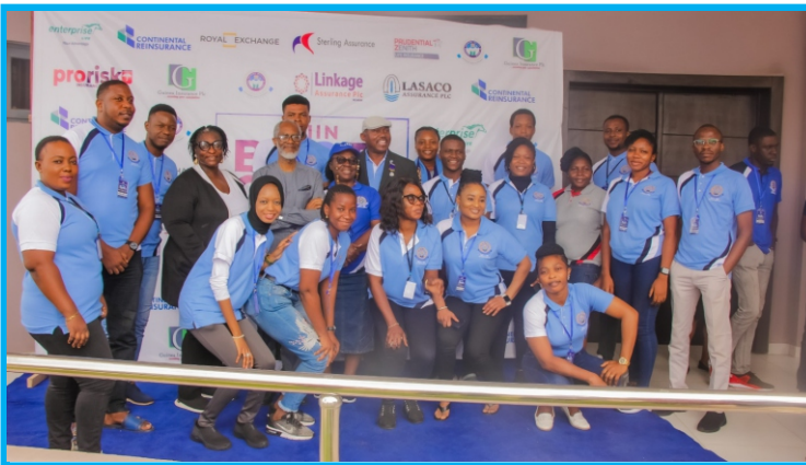
Members of Team Liberal at the CIIN Bootcamp 4.0