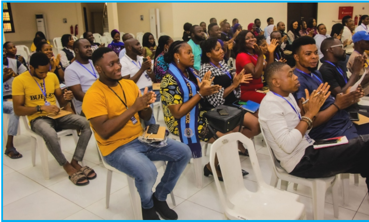
Cross section of Participants at the CIIN Bootcamp 4.0