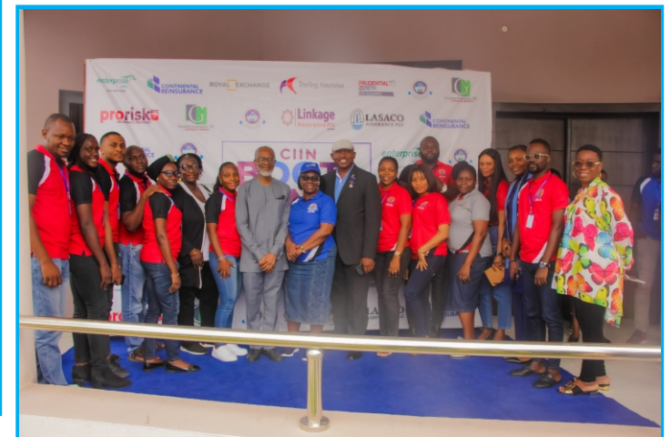
Members of Team Visionary at the CIIN Bootcamp 4.0.