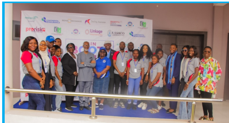
Members of Team Democrat at the CIIN Bootcamp 4.0