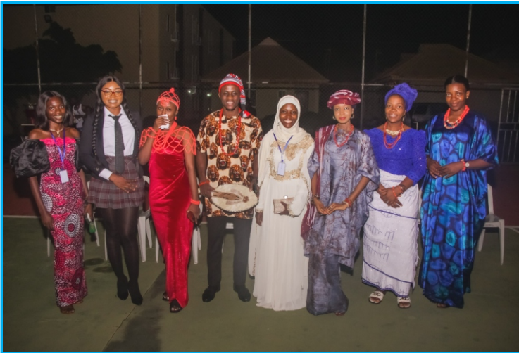
Some of the Participants displaying their Costumes at the CIIN BOOTCAMP 4.0 Gala Night.