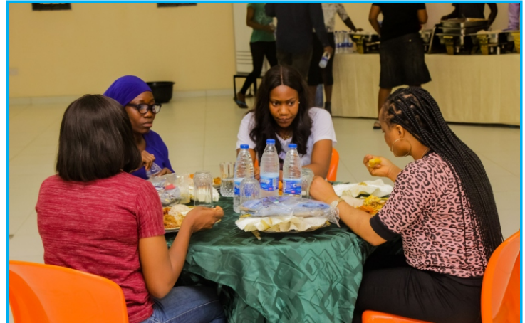
Some of the Participants of the Bootcamp 4.0 having their lunch.