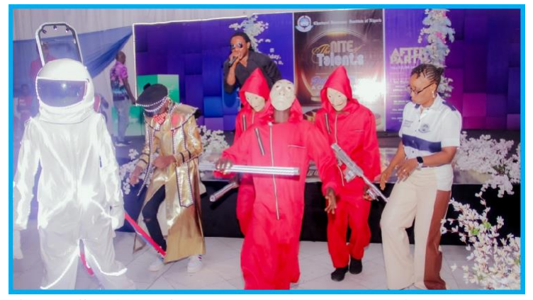
Cross-Section of Dancers with the Registrar at the Year 2024 CIIN Nite of Talents in Lagos.