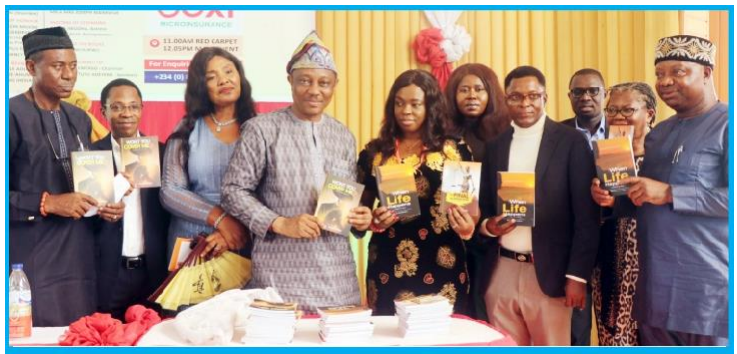
Cross-Section of Insurance Dignitaries at a book launch in Lagos.