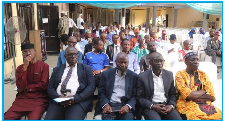
Cross-Section of Insurance Practitioners at the CIIN Year 2024 Ramadan Tafsir in Lagos.