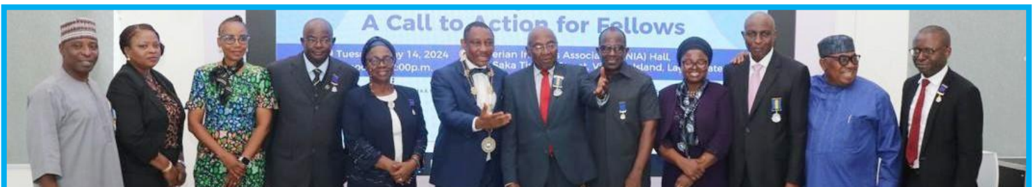
Cross Section of Dignitaries at the Year 2024 CIIN Fellows' Event in Lagos.