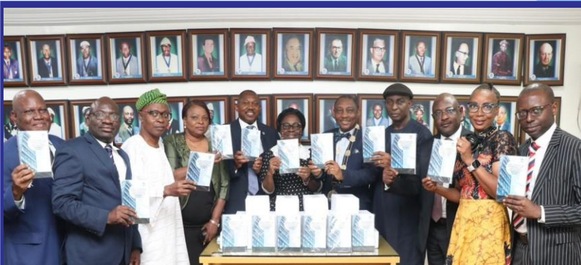
Cross section of Council Members of Chartered Insurance Institute of Nigeria at the launch of the book, Courts Judgements On Insurance And Related Cases In Nigerian Courts-Aide Memoirs For Members.