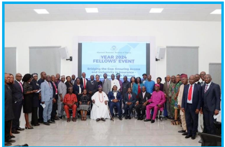
Cross Section of Participants at the Year 2024 CIIN Fellows' Event in Lagos.