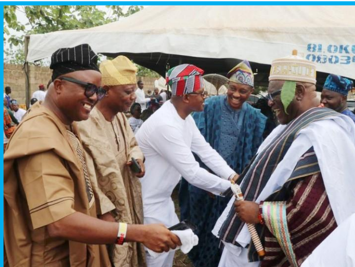
Burst of emotions among the newly conferred Chief and Industry Friends in Ilisan-Remo, Ogun State.