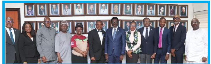
Group Photograph during the courtesy visit by the Commissioner at the Institute's Secretariat in Lagos.