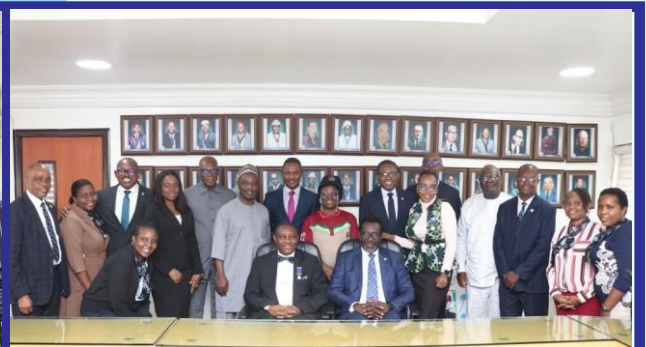
Cross section of dignitaries at the courtesy visit by the Commissioner for Insurance and NAICOM Management Team to the Institute's Secretariat in Lagos.