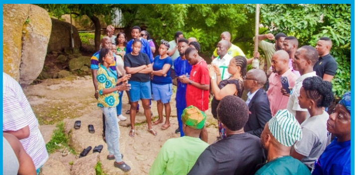
Cross Section of participants for the expedition visit to Olumo Rock at the Year 2024 CIIN Professionals' Forum, held at Park Inn by Radisson, Abeokuta, Ogun State.