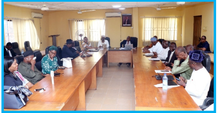
Cross Section at the courtesy visit to ILAN Secretariat, Ojueleba, Lagos State.