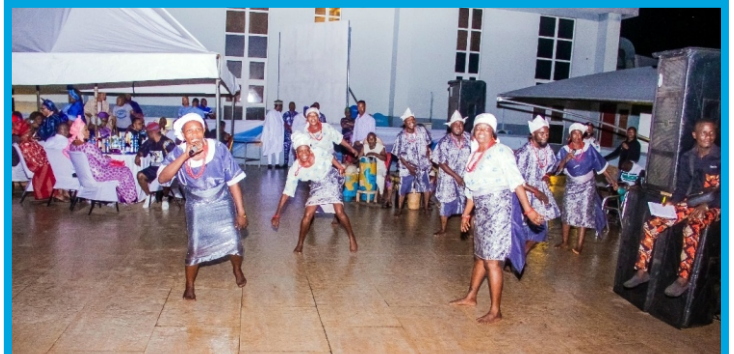
Performance act by dancers at the Year 2024 CIIN Professionals' Forum, held at Park Inn by Radisson, Abeokuta, Ogun State.