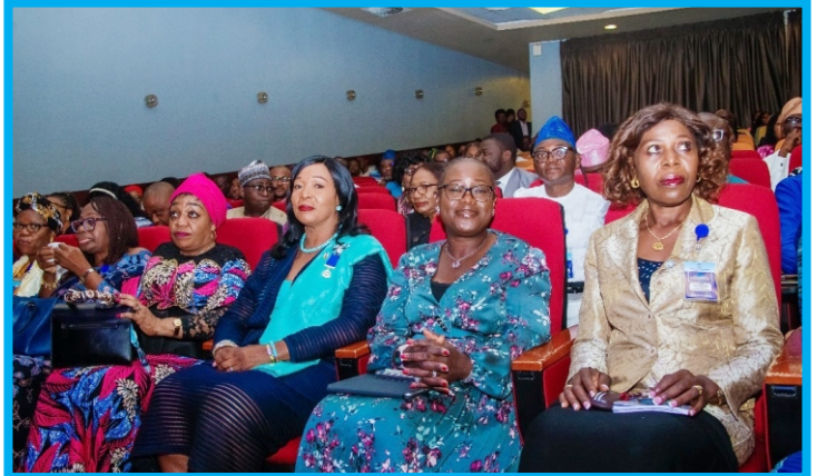
Faces of Dignitaries at the Year 2024 CIIN Professionals' Forum, held at Park Inn by Radisson, Abeokuta, Ogun State.