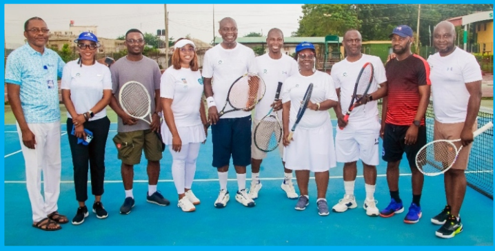
Group Photo with some of the Tennis players participating in the Lawn Tennis Tournament of the Year 2024 CIIN Professionals' Forum, held at the Abeokuta Sports Club, Ogun State.