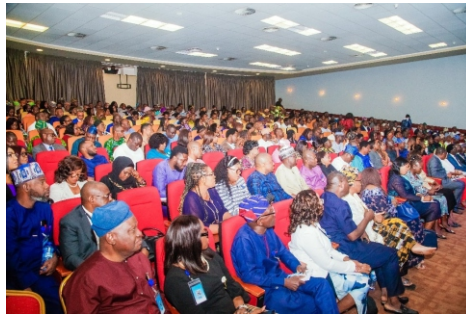
A wide view of attendees seated at the Year 2024 CIIN Professionals' Forum, held at Park Inn by Radisson, Abeokuta, Ogun State.

"I want to urge us to look inward and re-appraise our professional and business ethics and conduct. As professionals, we must conduct our business with utmost integrity and in a manner that does not bring disrepute to the profession," he said.