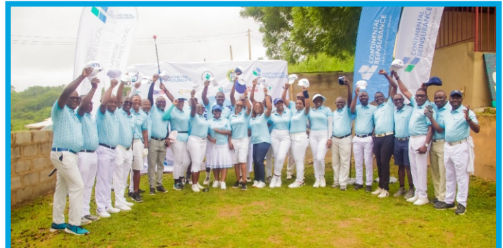
Golfers in attendance at the Golf Tournament of the Year 2024 CIIN Professional's Forum, held at the Abeokuta Golf Club, Ogun State.