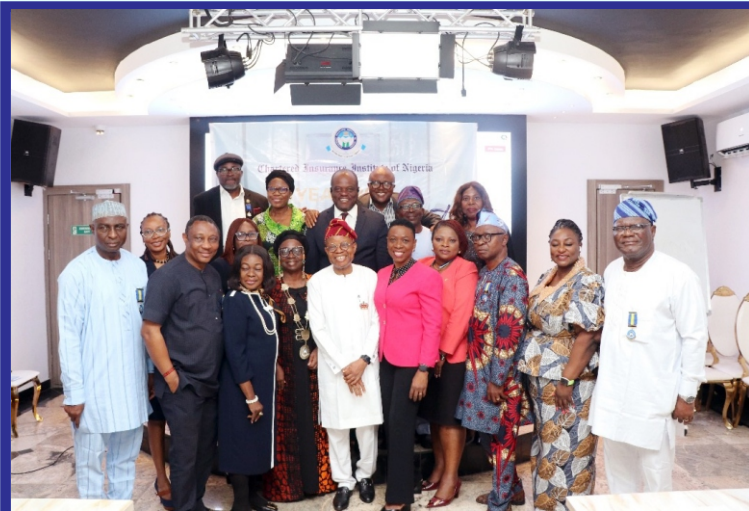
Institute Council Member and Faculties at the Year 2024 Annual Council Retreat, held at GTA Hotels, Ikeja, Lagos State.