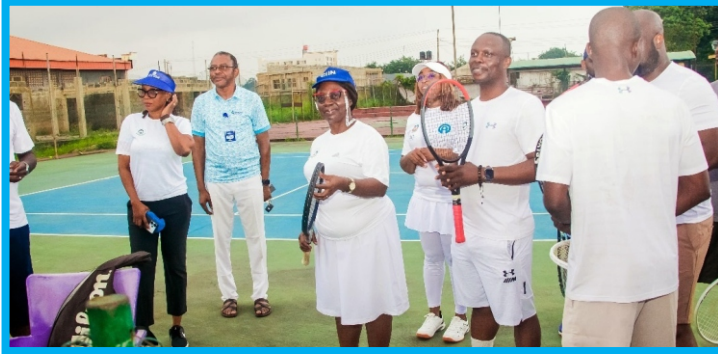
Cross section at the Tennis Tournament held at the Insurance Professional forum held at Raddison Park-inn, Abeokuta Ogun State.