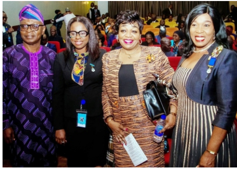
Faces of Dignitaries at the Year 2024 CIIN Professionals' Forum, held at Park Inn by Radisson, Abeokuta, Ogun State.