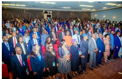
Wide view photo of attendees standing for the national anthem at the Year 2024 CIIN Professionals' Forum, held at Park Inn by Radisson, Abeokuta, Ogun State.

In his goodwill message, the Alake of Egbaland, Oba Adedotun Gbadebo III, commended insurance practitioners for providing financial safety nets and pledged support for the industry.