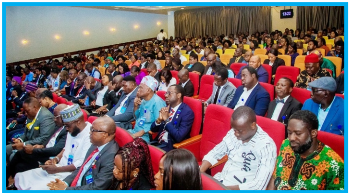
Cross section of Delegates at the Year 2024 CIIN Professionals' Forum, held at Park Inn by Radisson, Abeokuta, Ogun State.