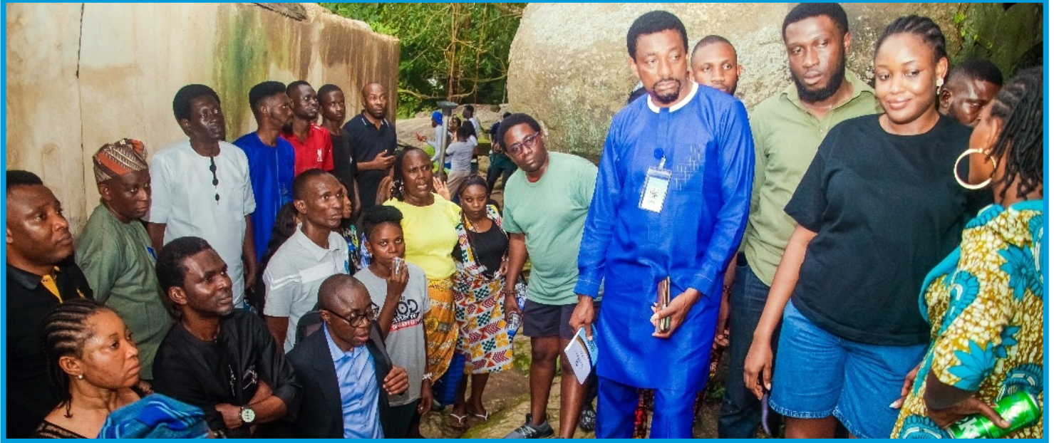
Close view of delegates at the visit to Olumo Rock at the Year 2024 CIIN Professionals' Forum, held at Park Inn by Radisson, Abeokuta, Ogun State.