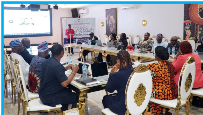
Cross section of Council Members at the Year 2024 Annual Council Retreat, held at GTA Hotel Ikeja, Lagos State.