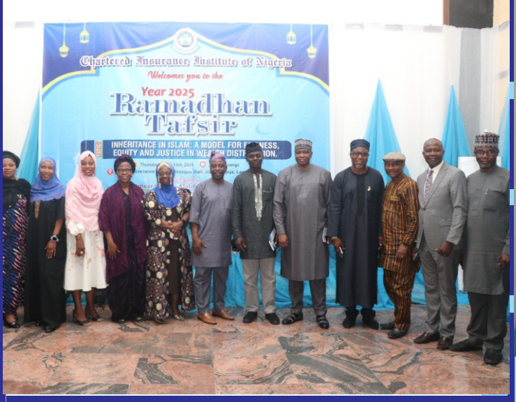
Group Photograph of Dignitaries at the Year 2025 Ramadan Tafsir held at Lagos Secretariat Central Mosque, Ikeja, Lagos State.