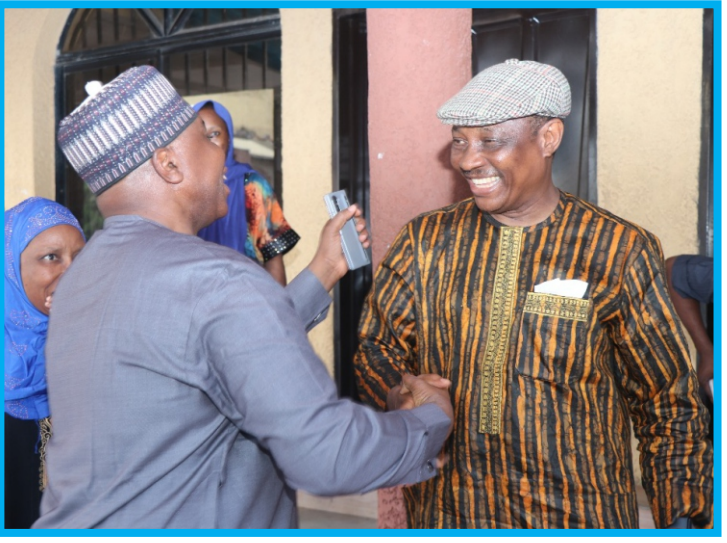
Dignitaries Exchanging Pleasantries at the Year 2025 Ramadan Tafsir held at Lagos Secretariat Central Mosque, Ikeja, Lagos State.