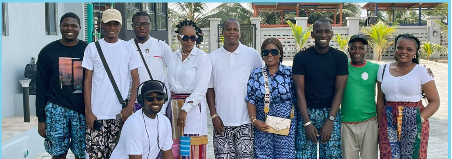
Group Photograph of CIIN Staff Members at the Year 2025 CIIN End of the Year Party held at Westside Beach, Lagos State.