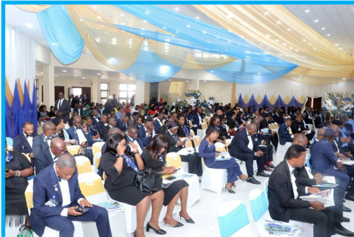
Cross-Section of delegates at The Year 2025 Induction Ceremony held at College of Insurance and Financial Management, Aseese Ogun State.