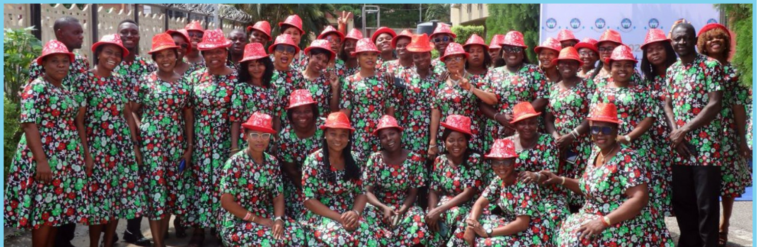
Group Photograph of the Insurance Industry Mass Choir at the Year 2025 Christmas Service/ Annual Thanksgiving held at All Saint's Anglican Church, Lagos State.