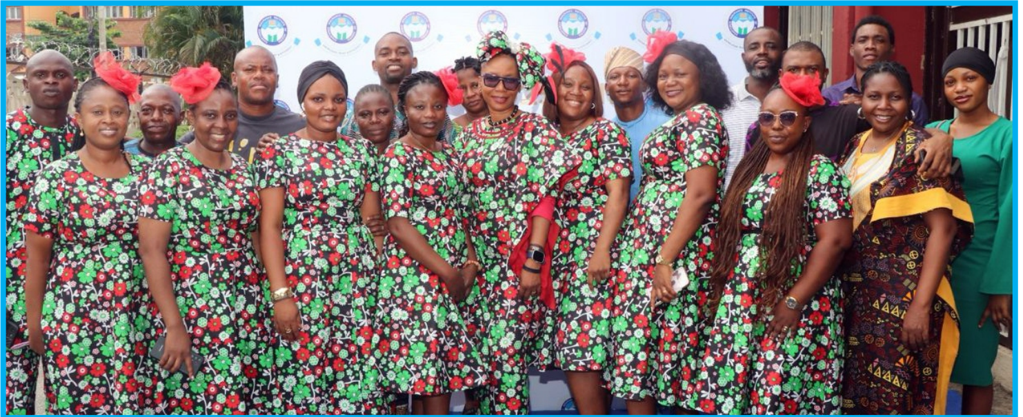
Group Photograph of Staff members at the Year 2025 Christmas Service/ Annual Thanksgiving held at All Saint's Anglican Church, Lagos State.