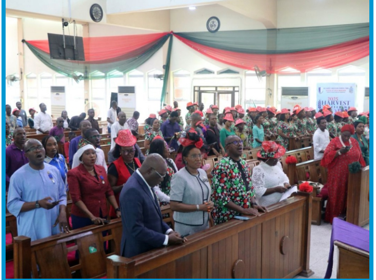
Cross Section of congregation at the Year 2025 Christmas Service/ Annual Thanksgiving held at All Saint's Anglican Church, Lagos State.