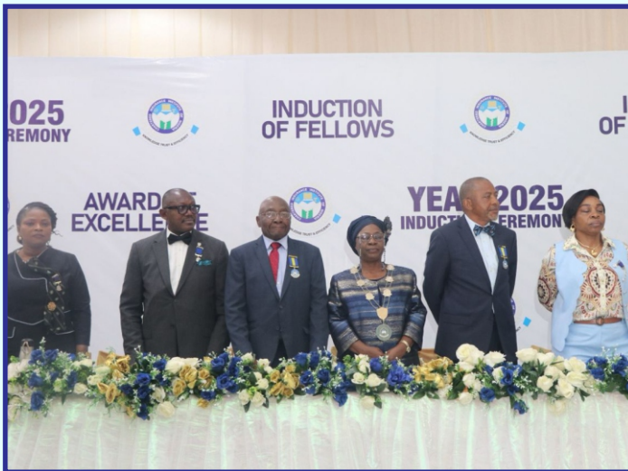
Group Photograph of Dignitaries at the High table at The Year 2025 Induction Ceremony held at College of Insurance and Financial Management, Aseese Ogun State.