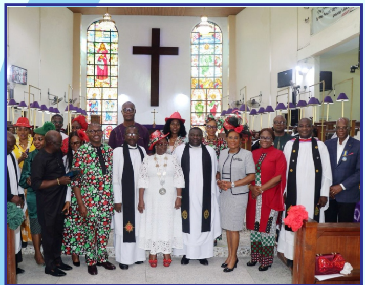
Group Photograph of Dignitaries at the Year 2025 Christmas Service/ Annual Thanksgiving held at All Saint's Anglican Church, Lagos State.