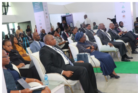
Cross Section of Dignitaries at Sector Transformation Consultative Forum 2026 held at Insurance House, Victoria Island, Lagos State.

According to her, sustainable transformation cannot be achieved in isolation. She stressed the importance of collaboration among regulators, operators and professional bodies to build a more resilient, inclusive and forward-looking insurance industry.