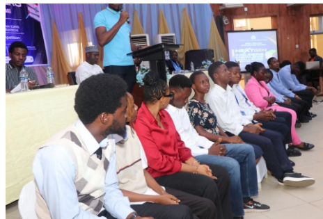
Cross Section of participants during the Quiz at Year 2026 Ambassador Pet Project held at LASUSTECH, Ikorodu, Lagos State.

She also acknowledged the contributions of lecturers in Insurance and Actuarial Science departments, reaffirming the Institute's commitment to supporting students in achieving their career aspirations.