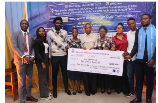
Presentation of Cash Award to the First-Runner up, University of Lagos (UNILAG) during the Quiz Competition held at Year 2026 Ambassador Pet Project held at LASUSTECH, Ikorodu, Lagos State.