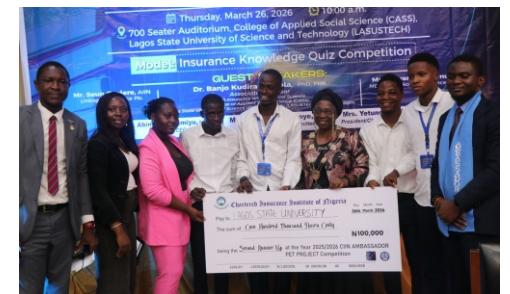
Presentation of Cash Award to the Second runner up, Lagos State University (LASU) during the Quiz Competition held at Year 2026 Ambassador Pet Project held at LASUSTECH, Ikorodu, Lagos State.