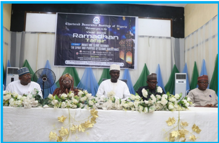
Photograph of Dignitaries on the high table at Year 2026 Ramadan Tafsir held at Lagos Secretariat Central Mosque Hall Alausa, Ikeja, Lagos State.