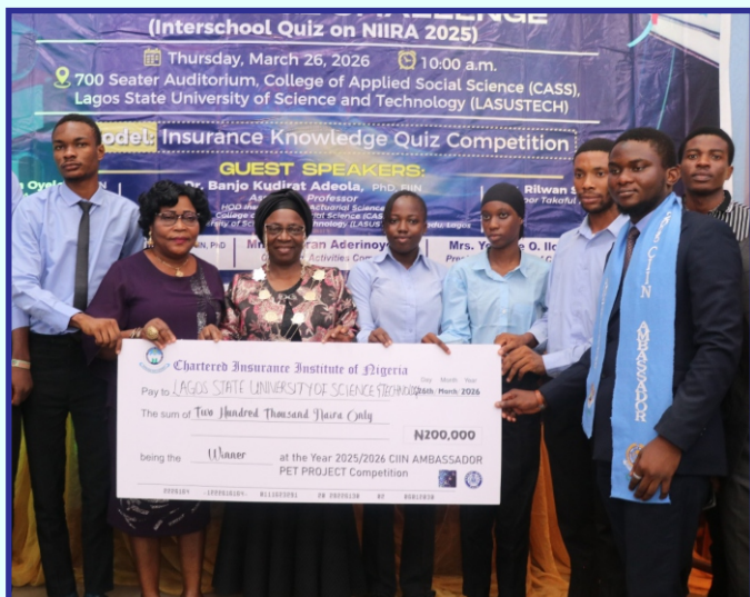
Presentation of Award to LASUSTECH, Winner of the Quiz Competition held during the Year 2026 Ambassador Pet Project held at LASUSTECH, Ikorodu, Lagos State.